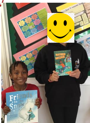
Reading Raffle Winners