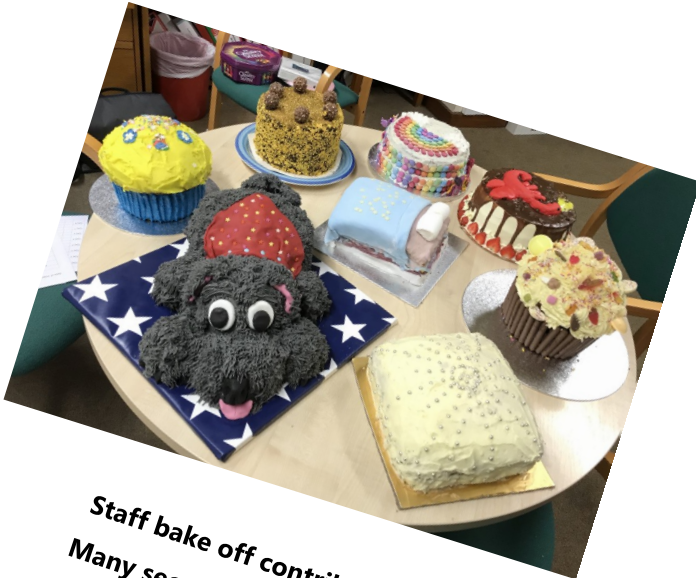
Staff bake off contributions. Many second careers beckon!