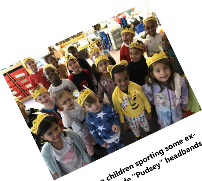
Reception children sporting some excellent self made "Pudsey" headbands