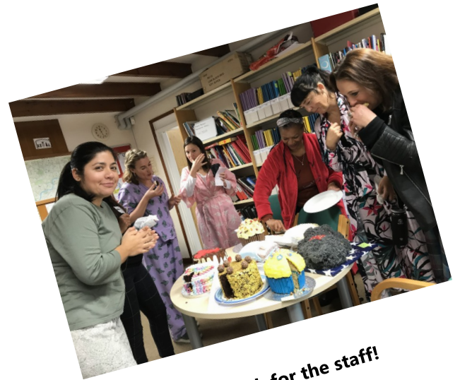
A quick tea break for the staff!

Achieving excellence in a happy, nurturing and safe environment