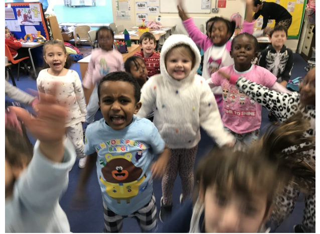
Y1 doing the Big Morning Move with Joe Wicks